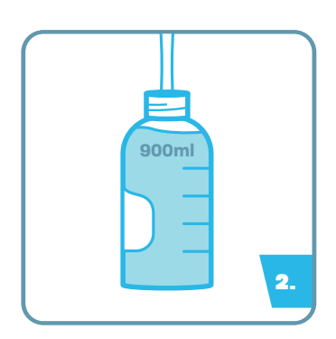
Fill with 900ml of ambient tap water until solution reaches the top volume marker on the dosing bottle.