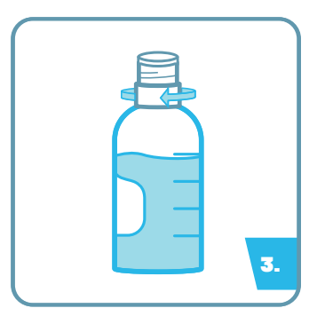
Affix the dosing cap to the dosing