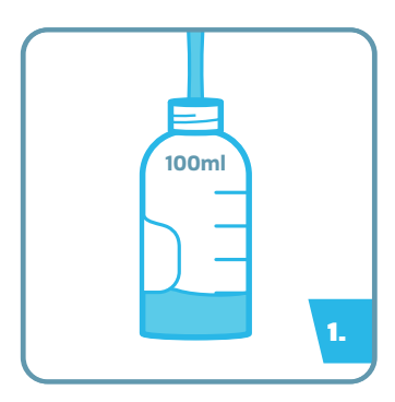
Fill with 100ml of concentrate solution up to the first volume marker on the dosing bottle.